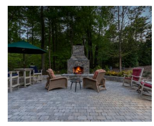
But it just keeps getting better as you enter the lower level of the yard where you are greeted by an extraordinary, Belgard paved patio with stone wood-burning fireplace and landscape night lighting.