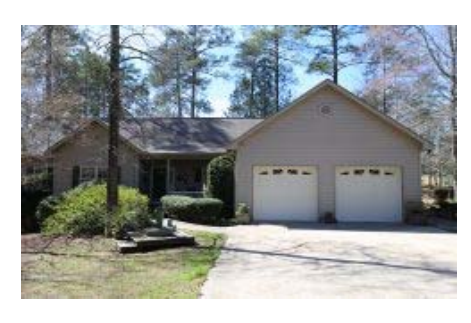
107 Hickory Point Under Contract Golf $249,000