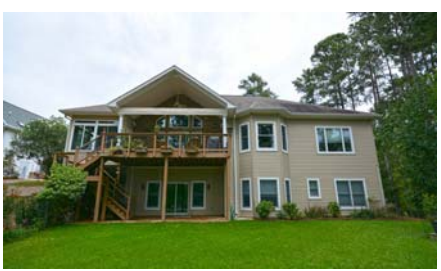
210 Milford Place 4BDRs 3 Baths 3,750 sqft Lake $559,000