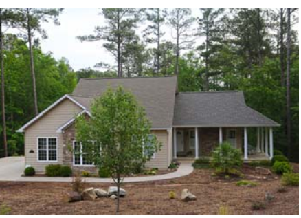
203 Hummingbird Under Contract Interior $259,000