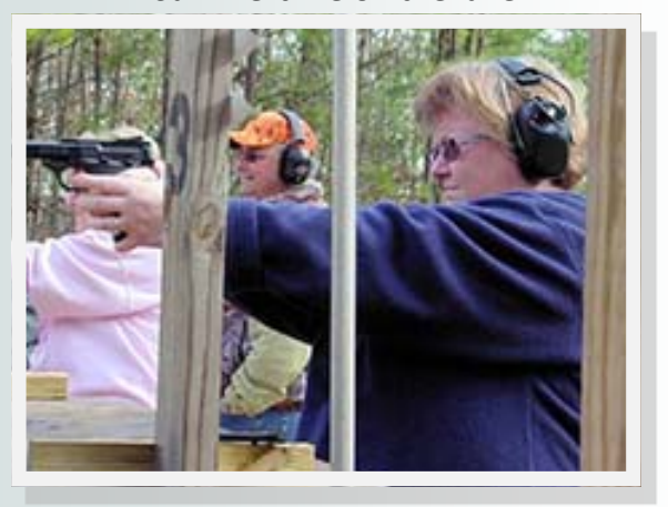
On the Shooting Range in Fall