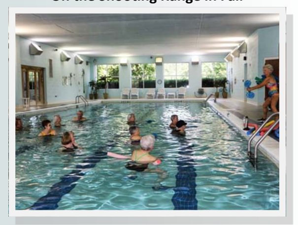
Indoor Swimming in the Winter

Monthly Summary for 2017 Monthly Summary for January