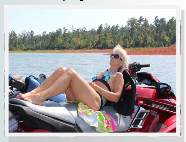
Summertime on the lake