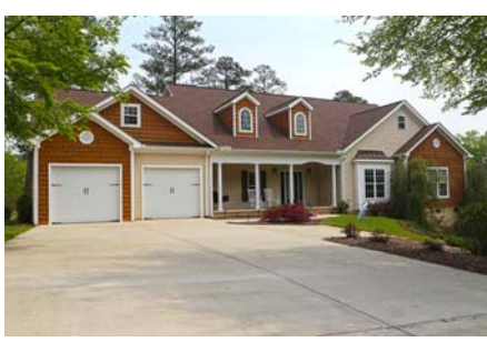
208 Player Lane 3BDRs 2.5 Baths 2,435sqft Golf $359,000