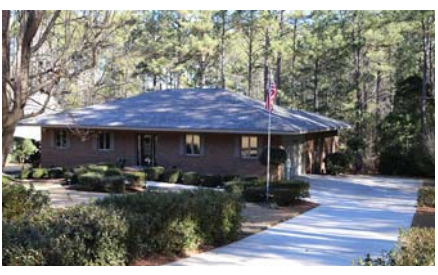
160 Shenandoah 3 BDRs 2.5 Baths 2,100 sqft Lake $310,000