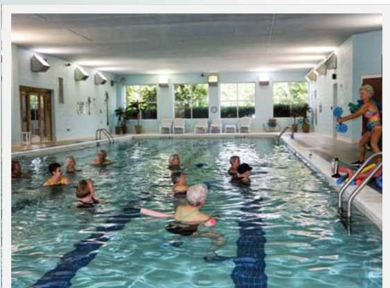
Indoor Swimming in the Winter