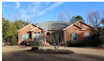
291 Fairway 3 BDRs 2.5 Baths 2,531 sqft Golf $319,000