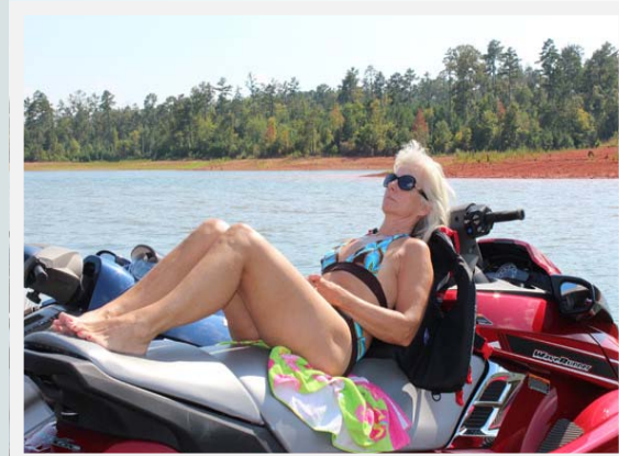
Summertime on the lake