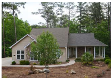
203 Hummingbird Under Contract Interior $259,000