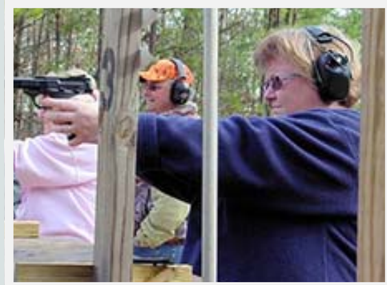
On the Shooting Range in Fall