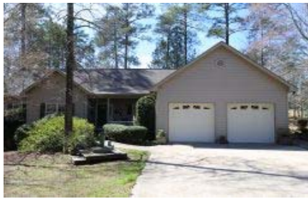
107 Hickory Point Under Contract Golf $249,000