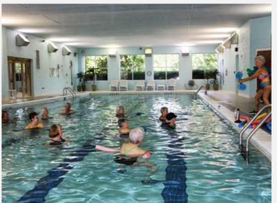
Indoor Swimming in the Winter