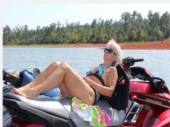
Summertime on the lake