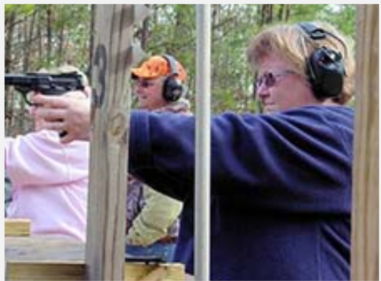
On the Shooting Range in Fall