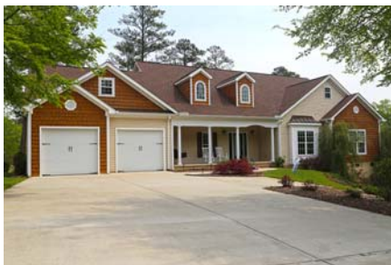
208 Player Lane Golf $359,000