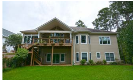
210 Milford Place Lake $559,000