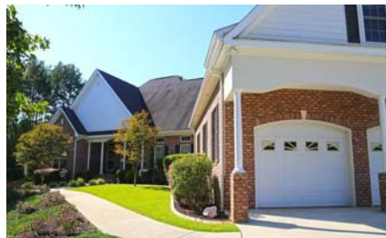
206 Fern Lane Golf $456,900