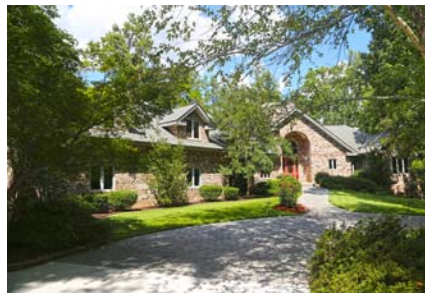
220 Gerard Circle Lake $895,000