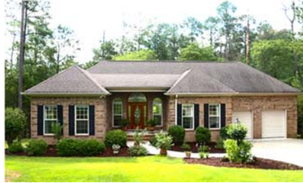
313 Misty Cove Lake $387,000

Once in a lifetime there seems to be an unbelievable opportunity not often presented to you, that makes you sit up and take notice! That opportunity has arrived. We have several golf and lake homes that are at exceptionally opportunity!