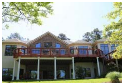
125 Bereau Lake $635,000