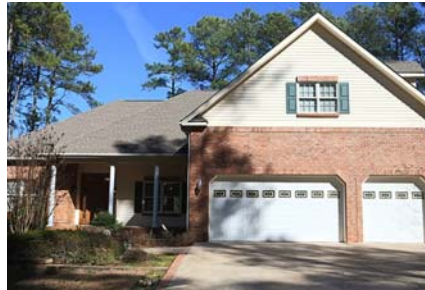
269 Fairway Golf $339,000