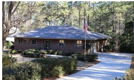
160 Shenandoah Lake $310,000